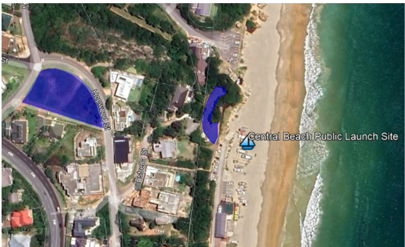
Figure 3 - Additional overflow parking areas (shown in blue) during High Season conditions

During high tourist season Plettenberg Bay, and Central Beach in particular, experience an exponential increase in users of the area and the facility. Additional trailer and vehicle parking areas are required and is to be guided and monitored by Municipal Beach Control. In order to accommodate the additional recreational users during this time period the grassed platform above the beach is utilised for the supplementary parking of approximately 30 trailers. Additional overflow parking is also available on the corner of Hopwood and Meeding Street. All trailers parked in this area have to clearly display their cell phone number. Beach Control is to assist in guiding the parking of trailers and vehicles in order to maintain access and control of the facility. Contact numbers of users are to be noted to be able to communicate with them should vehicles or trailers need to be moved.