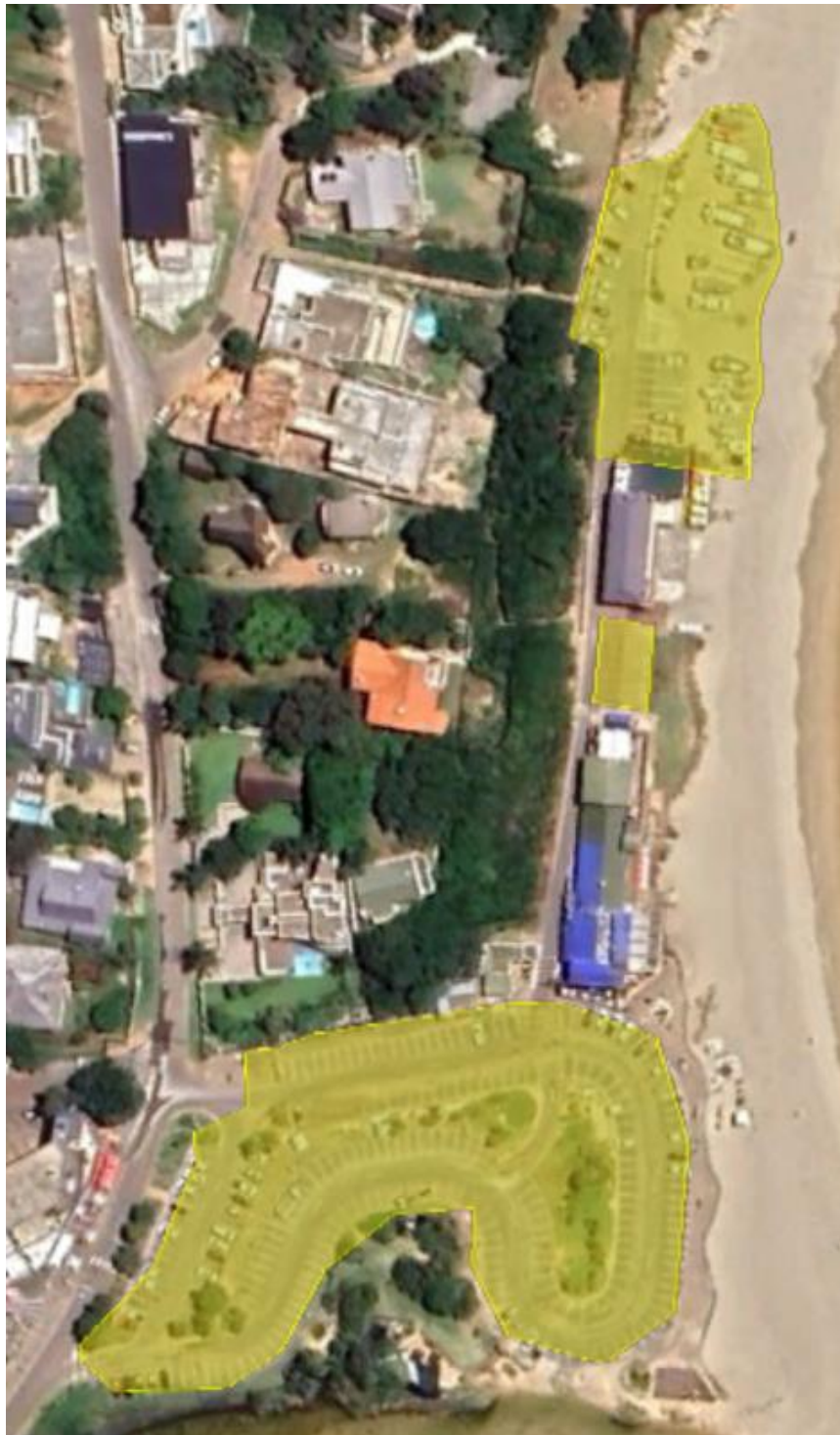
Figure 2 - Extent of parking areas (indicated in yellow) at Central Beach, Public Launch Site.